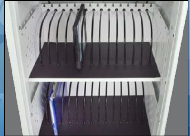
Storage for up to 30 tablets or netbooks