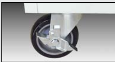
Four 4" swiveling casters (2 with brake locks).

The MCC10 is an affordable solution for charging, securing and transporting up to 30 tablets or netbooks. Rubber coated dividers and padded shelves provide protection to your devices. Plenty of ventilation allows air to circulate freely through the unit. The MCC10 includes a top inner shelf, two 16-outlet vertical electrical outlets and 4" wheels with locking brakes. Front and back doors lock with a traditional key system for secure storage and peace of mind knowing your investment is protected.